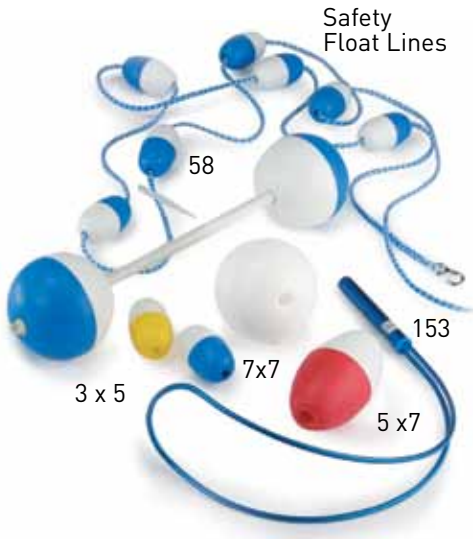
Safety Float Lines

Unsinkable, durable polyethylene floats come in a variety of sizes and color combinations including 3" x 5" Ovals, 5" x 7" Ovals and 7" x 7" Rounds. Safety Float lines are also available sized to fit standard and some custom pool widths. A complete listing, including float keepers, is included in the Pentair catalog or price list.